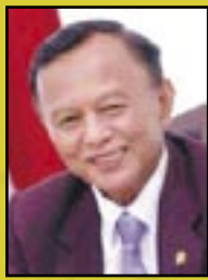
Rachmat Witoelar Minister, State Ministry of Environment

The recent earthquake that struck Yogyakarta has brought about much suffering to the people of Yogyakarta and Central Java. Nevertheless this has not deterred our intention to host the largest regional meeting on urban air quality in Asia in Yogyakarta. The workshop which was originally scheduled for 13-15 September will now take place on 13-15 December 2006.