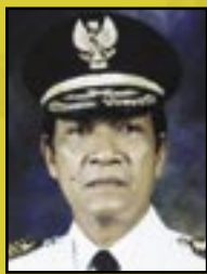
Sri Sultan Hamengku Buwono X Governor, Special Region of Yogyakarta

The State Ministry of the Environment of the Republic of Indonesia has initiated the formulation of a national clean air act to intensify initial air quality management efforts and to respond to the public concern on the adverse effects of air pollution. We look upon BAQ 2006 as an opportunity not only share our efforts but also to learn from experiences of our Asian neighbors as well as those outside Asia. Also by having the workshop in Yogyakarta, this will contribute to the revival of Yogyakarta and its economy. I hope that we can all work together to accelerate efforts to make blue skies a permanent part of the landscape of Indonesia and Yogyakarta in particular, as well as of other Asian countries.